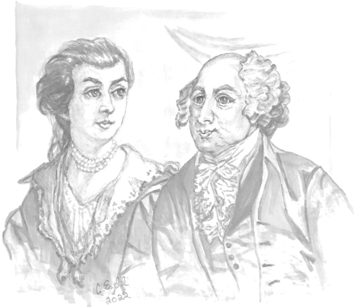
John and Abigail Adams

These epistles reflect their warm companionship as well as her profound and historical influence upon him during his time at the Continental Congress and in Europe as a diplomat, when he was the first Vice-President under George Washington and during his challenging time as the second US President. Thereafter, John and Abigail lived on their farm in Quincy, Massachusetts.